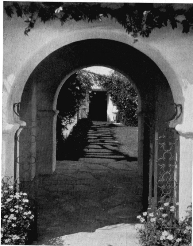
THE BUCHANAN ENTRANCE GATE A gem of Californian Architecture

Let us be careful to see that everyone respects the common interest in the beauty of our parks and hillsides. A bouquet of wild blooms soon fades, but