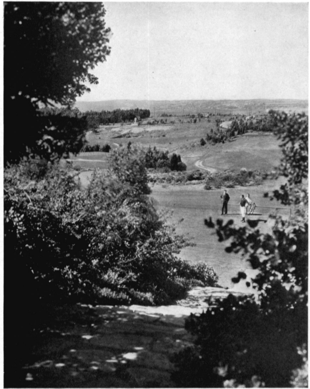
THE FIRST TEE As seen from in front of the Golf Shop

if left where they grow, they add to everyone's pleasure and scatter their seeds for a more abundant flowering next year.