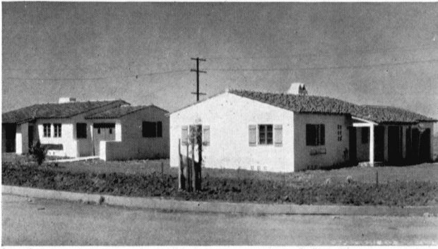
PART OF A GROUP OF HOUSES JUST COMPLETED AT THE CORNER OF VIA LARGAVISTA AND VIA COLORIN, VALMONTE

hiser of Cleveland, played the Palos Verdes course several times. He writes that he desires to "compliment the management for the magnificent golf course they have succeeded in building. No other course of the numerous courses played in California appealed quite so strongly as did Palos Verdes."