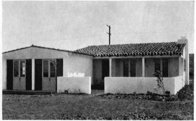
A NEW HOUSE JUST COMPLETED ON VIA LARGAVISTA, VALMONTE

The following expressions of appreciation and interest in what has been done at Palos Verdes Estates have come, unsolicited, to the Bulletin , both from neighbors and from as far east as Cleveland, Buffalo and Pittsburgh.