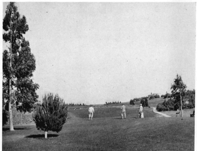
A PARKLIKE FAIRWAY ON THE PALOS VERDES COURSE

The Bulletin will be sent without charge for three months or more to any address on request.