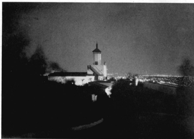
LA VENTA BY NIGHT