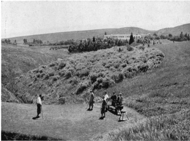
THE EIGHTEENTH TEE

Tentative approval was given the sketches for