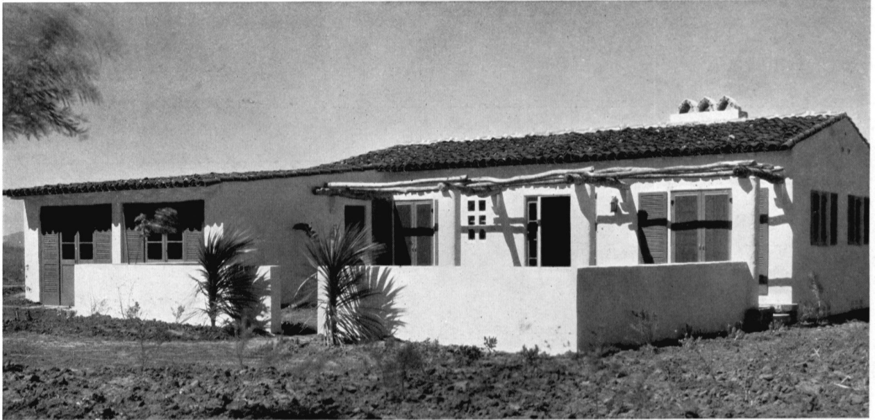
A NEW HOUSE JUST COMPLETED ON VIA GAVILAN, VALMONTE