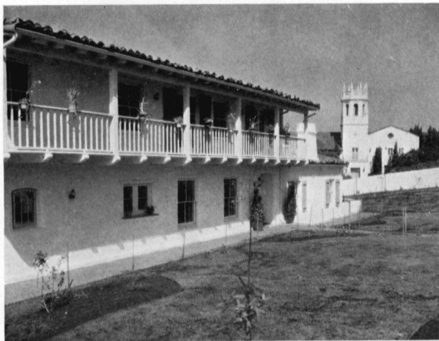
A CLOSE UP OF THE NEW BANDINI HOME The School Tower in the Background

The Bulletin will be sent for three months, or more, to any address upon request.