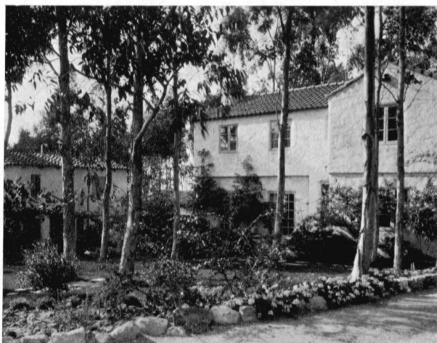
THE HALF SHADE OF EUCALYPTUS TREES IS VERY GRATEFUL ON A SUMMER DAY