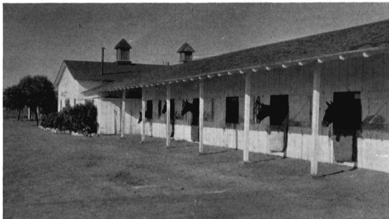
AT THE PALOS VERDES STABLES