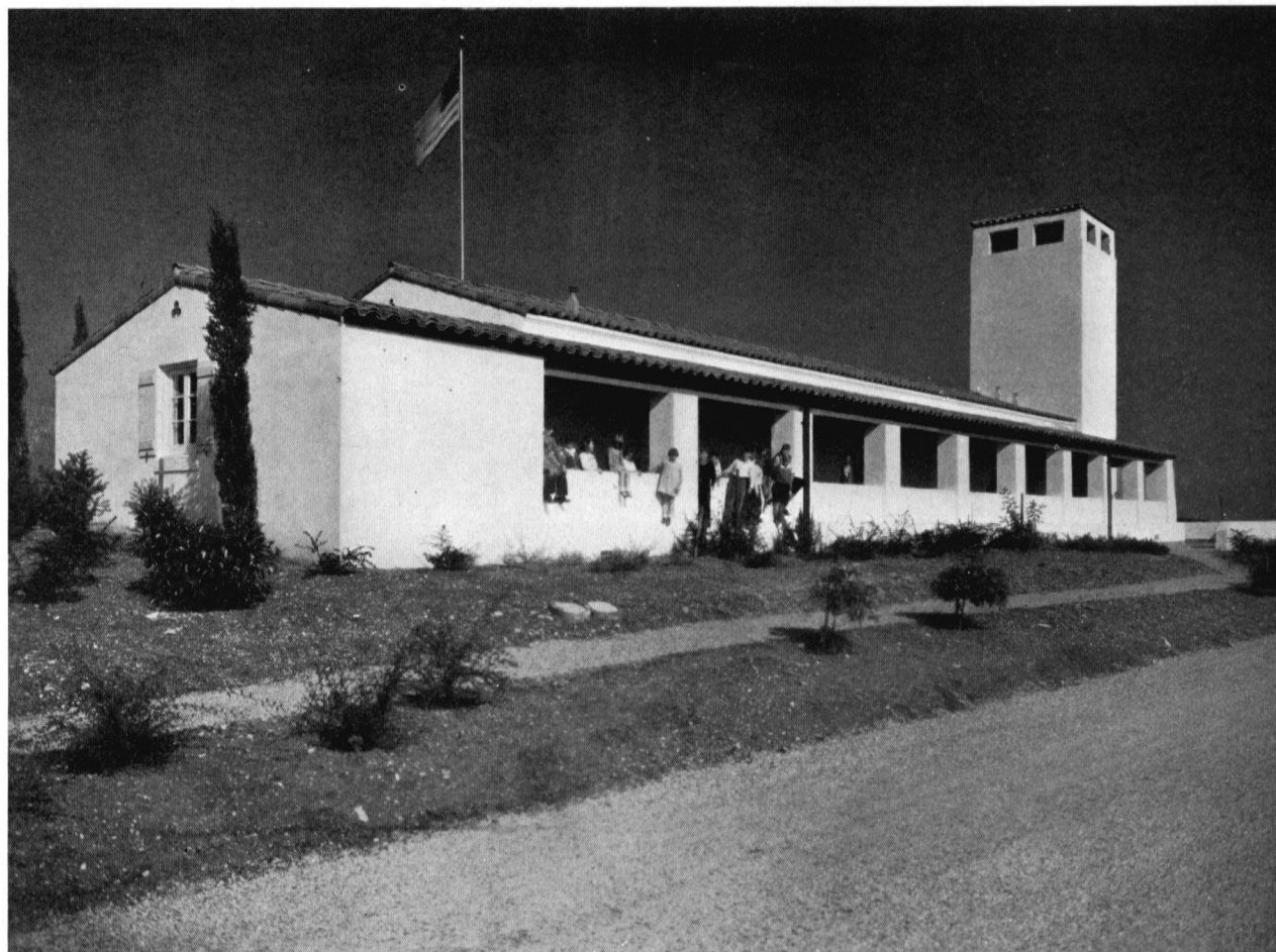
THE MIRALESTE SCHOOL

The grandstand is being considerably enlarged in anticipation of a record crowd.